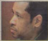
Opening statements in the sniper trial are expected Thursday afternoon. Page A-22